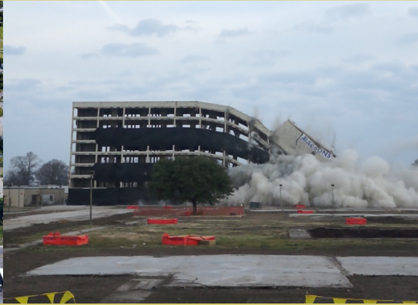
Eight story building entirely demolished by implosion in fifteen seconds.