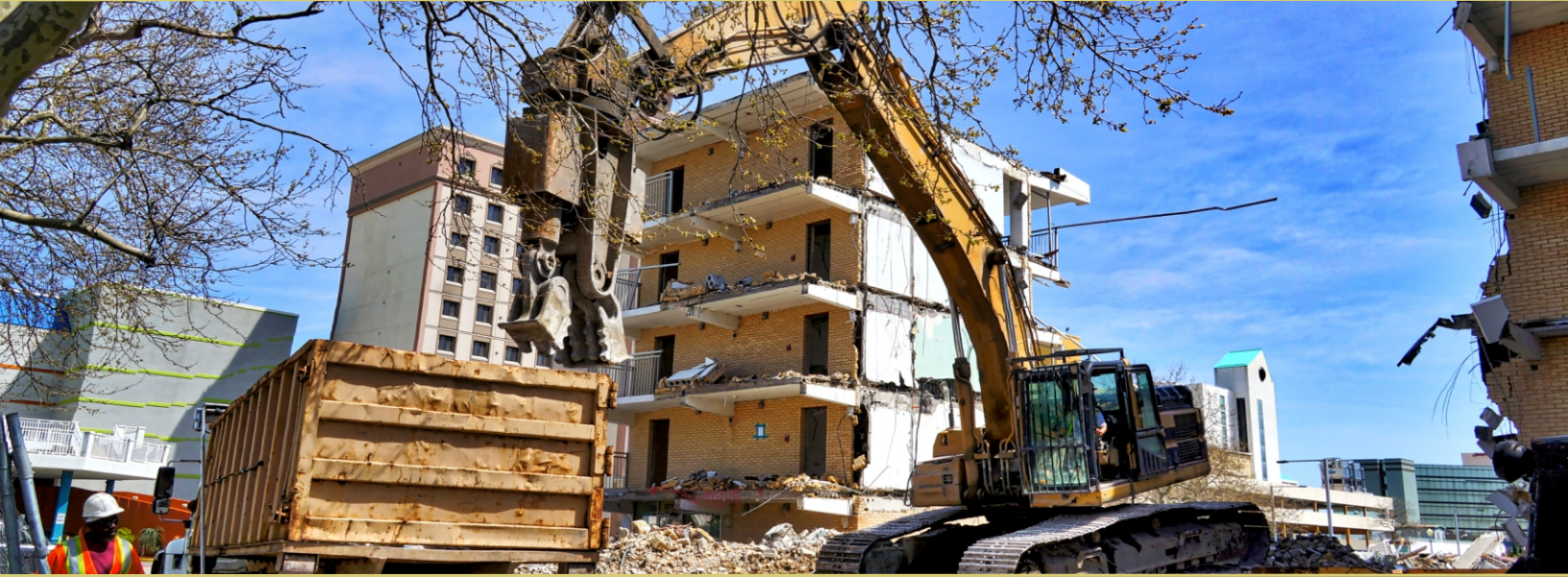
Demolition carefully executed on the Virginia Beach Oceanfront.