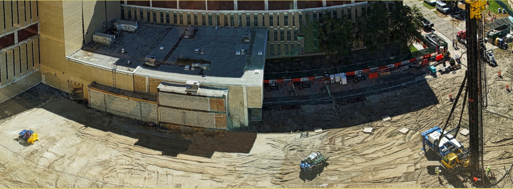
Demolition of former GDC Building with only 6" clearance to adjacent building.