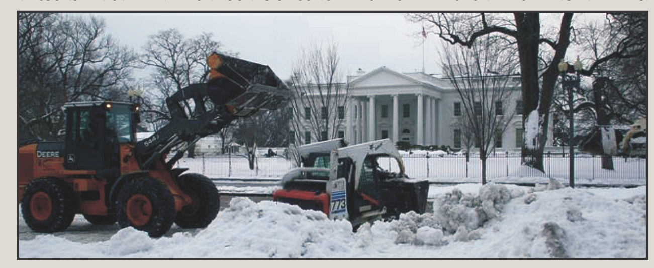
MACSONS OPERATIONS IN WASHINGTON DC FOR EMERGENCY SNOW REMOVAL AT THE WHITE HOUSE.