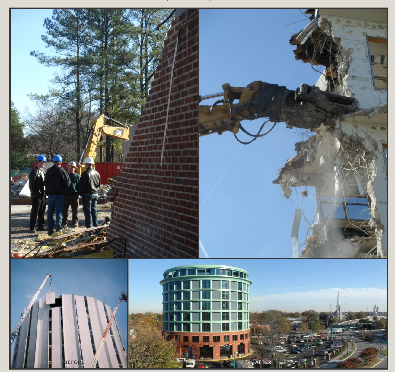
MACSONS REMOVED A MILLION POUNDS OF CONCRETE OFF OF THE ROTUNDA BUILDING IN 19 DAYS

MACSONS ENSURES GOOD COMMUNICATION, PLANNING, IMPLEMENTATION AND CUSTOMER SATISFACTION.